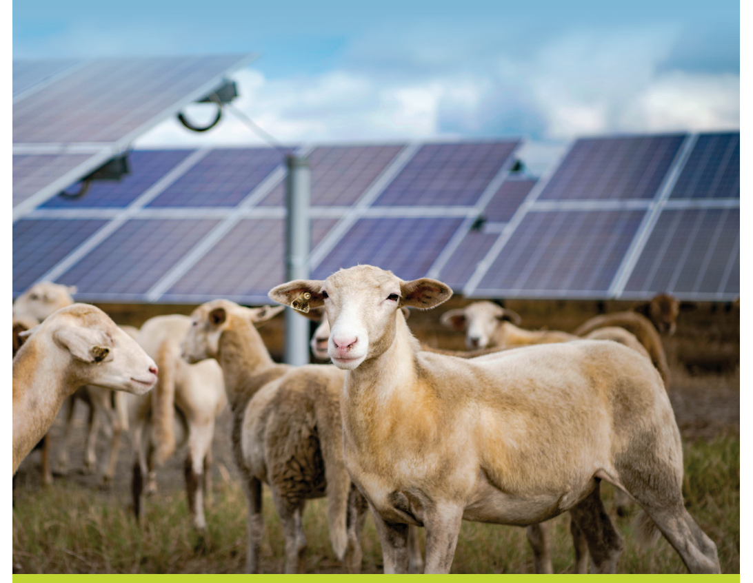
A herd of sheep at the FPL Blue Cypress Solar Energy Center maintain the grounds, helping keep the grass low.

Be among the first to get program updates. Visit: >> FPL.com/solartogether